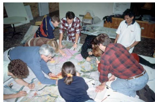
Participants in the design workshop.