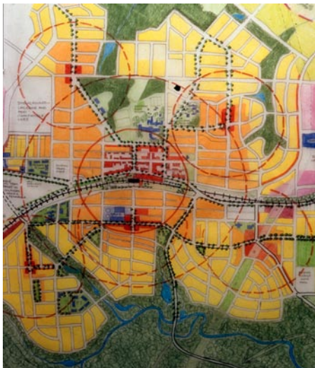
Proposed design for Morriset township.