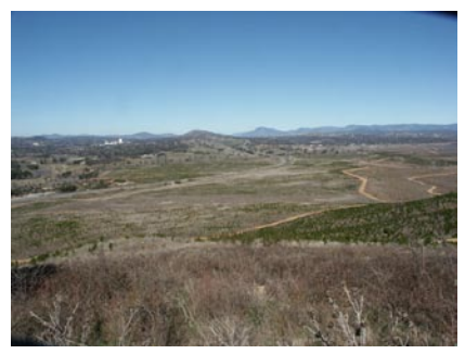
Former pine plantations in the Molonglo Valley.