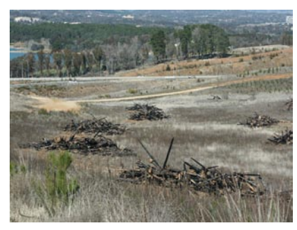
View over a section of the Molonglo Valley showing charred remains of the pine plantations destroyed in the 2003 bushfires.