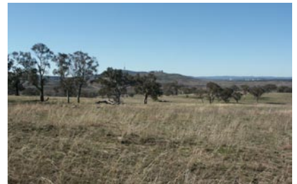
View from the Molonglo Valley towards Canberra.