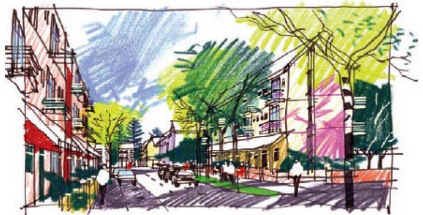
NEW STREET FROM BONG BONG STREET TO MARINING STREET LOOKING NORTH EASTWARDS

ESD Charrette Outcomes Report published, partial implementation with further review