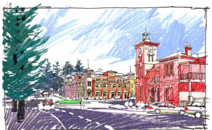
TOWN OFFICE VIEW DORSET & MARINING STS CORNER